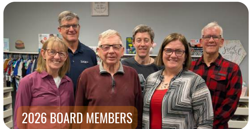
2026 BOARD MEMBERS