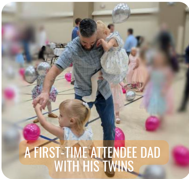
A FIRST-TIME ATTENDEE DAD WITH HIS TWINS

The Father-Daughter Dance hosted by First Choice Clinic welcomed 234 attendees! Our largest dance event yet was held on April 12 th . Dads and their daughters enjoyed music, refreshments, and crafts, along with a time to enjoy the unique and special gift each daughter is. Many thanks to all the volunteers and to First Covenant Church in Red Wing for the use of their gym.