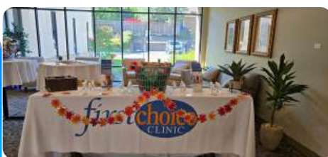
Supporters were encouraged to take a leaf and return the requested donation by Thanksgiving.