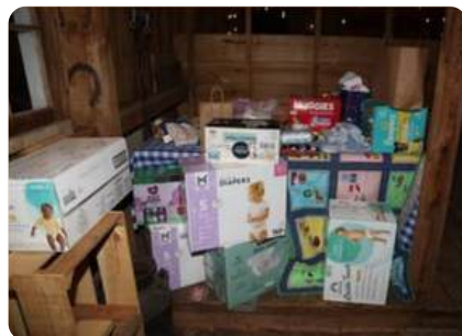
In addition to financial donations, First Choice Clinic was blessed with many material donations on the day of the banquet. A heartfelt Thank you!